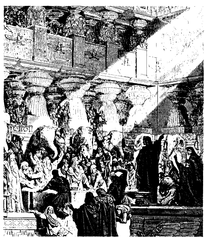
Daniel Interpreting the Writing on the Wall

confirmation that this is a fixed period of 2,520 years<sup>2</sup> by multiplying 7 by 360 Jewish calendar days rather than 354 lunar days or 365 solar days.<sup>3</sup> In other words, "Searching what, or what manner of time the Spirit of Christ which was in them did signify." (I Peter 1:11) We hold that these seven times are based on the same 360 day formula that is required in Revelation 11 and 12, where 3\frac{1}{2} times (years), 42 months and 1260 days all express the length of one span. Further, we hold that each day is fulfilled by a natural year, as in Revelation 11 and 12.