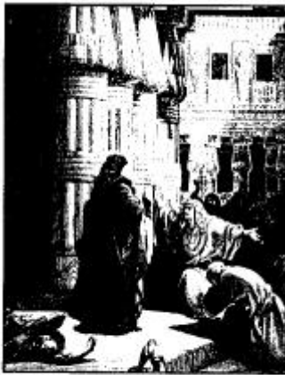
Egyptians Urge Moses to Depart

World War 1, some non-Watchtower groups actually opposed public witness (as being out of date); understandably most have faded. Parents today should be wary of their children being diverted by this world's allures, or even destroyed by mindless cults or drugs. But we should use modern technology in fulfilling Matthew 24:14: radio, satellite TV, tape recorders, modern printing, rapid travel, etc. Yet Pharaoh still will not let the Lord's people go (Exod. 10:20).