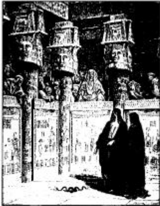
Moses and Aaron Before Pharaoh

her, my people” (The concept is also shown in Lot being called out of Sodom, and Elijah being called out of the cities before being taken up.)