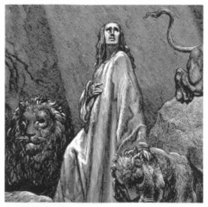
Daniel in the Den of Lions

The king continued his efforts until the last minute, but finally the sun went down and he could delay no longer. The sentence must now be carried out. He called Daniel and talked to him, telling him how he had been ensnared and that he could find no way out. Then he made a statement that was strange for a