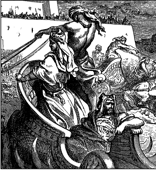
David Conquering the Ammonites

portion of ground. But the Jubusite chief generously offered it to the king as a gift, together with the oxen which would be used as a sacrifice and his wooden tools or implements for the fire. Ornan's unselfish readiness is shown in the fact that he took for granted that the threshingfloor was to be given to David and does not make mention of it in the negotiation, but offers everything on the place to be used in averting the plague. He had seen the death angel as well. Ornan was bent on staying the death angel as quickly as possible, lest it fall on him and his family. He had faith as well that a sacrifice would suffice to atone for the wrong that had been done. But David refused this generosity and great spirit of sacrifice of a non-Israelite, and made arrangements to pay for this land, the oxen and the implements. "And King David said to Ornan, Nay; but I will verily buy it for the full price: for I will not take that which is thine for the LORD, nor offer burnt offerings without cost. So David gave to Ornan for the place six hundred shekels of gold by weight" (1 Chronicles 21:24-25).